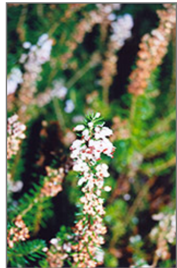
Scotch Heather flowers