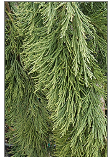
Weeping Giant Sequoia foliage