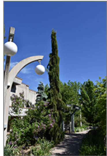
Weeping Giant Sequoia