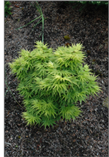
Mikawa Yatsubusa Japanese Maple

Mikawa Yatsubusa Japanese Maple is a fine choice for the yard, but it is also a good selection for planting in outdoor pots and containers. With its upright habit of growth, it is best suited for use as a 'thriller' in the 'spiller-thriller-filler' container combination; plant it near the center of the pot, surrounded by smaller plants and those that spill over the edges. It is even sizeable enough that it can be grown alone in a suitable container. Note that when grown in a container, it may not perform exactly as indicated on the tag - this is to be expected. Also note that when growing plants in outdoor containers and baskets, they may require more frequent waterings than they would in the yard or garden.