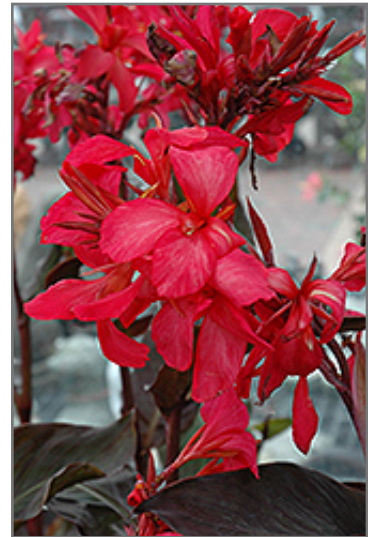
Australia Canna flowers

-- THIS IS A TROPICAL PLANT AND SHOULD NOT BE EXPECTED TO SURVIVE THE WINTER OUTDOORS IN OUR CLIMATE --