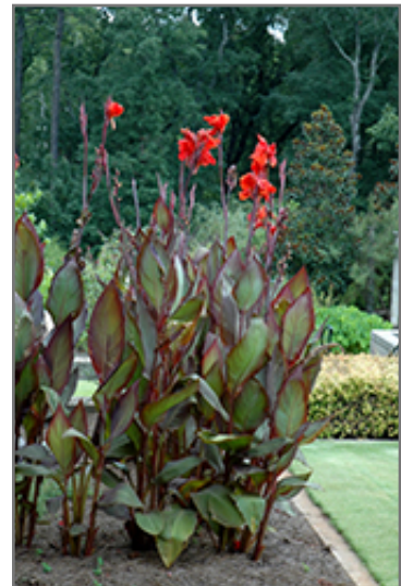
Australia Canna in bloom