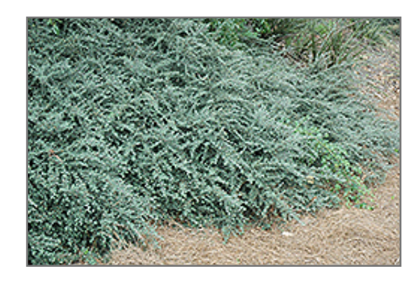
Gray Leaf Cotoneaster

Gray Leaf Cotoneaster will grow to be about 4 feet tall at maturity, with a spread of 6 feet. It tends to fill out right to the ground and therefore doesn't necessarily require facer plants in front. It grows at a fast rate, and under ideal conditions can be expected to live for approximately 30 years.