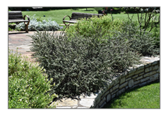
Gray Leaf Cotoneaster