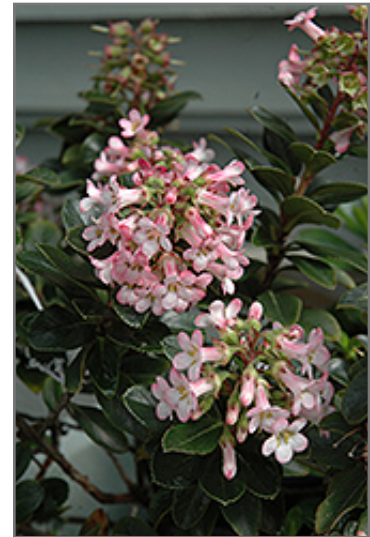
Pink Princess Escallonia flowers

Pink Princess Escallonia is recommended for the following landscape applications;