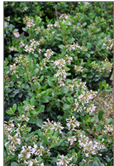
Pink Princess Escallonia in bloom