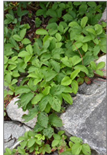
Common Wild Strawberry

Common Wild Strawberry is a good choice for the edible garden, but it is also well-suited for use in outdoor pots and containers. Because of its spreading habit of growth, it is ideally suited for use as a 'spiller' in the 'spiller-thriller-filler' container combination; plant it near the edges where it can spill gracefully over the pot. Note that when growing plants in outdoor containers and baskets, they may require more frequent waterings than they would in the yard or garden.