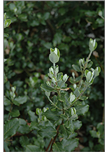
James Roof Silk Tassel Bush foliage