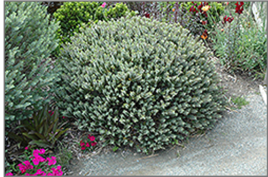
Red Edge Hebe

Red Edge Hebe is recommended for the following landscape applications;