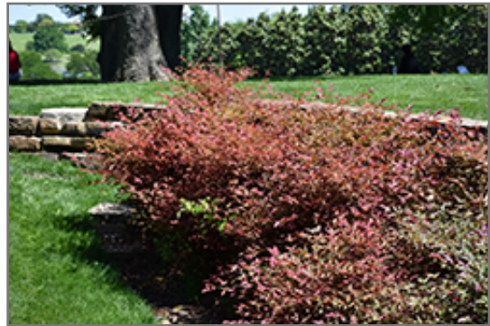
Flirt Nandina

Flirt Nandina is recommended for the following landscape applications;