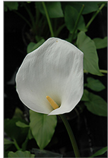
Calla Lily flowers