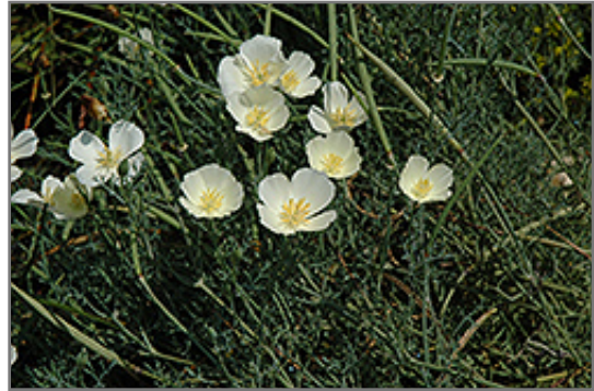
Prairie Sunset Rain Lily flowers