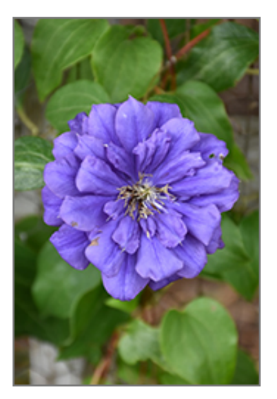
Franziska Marie Clematis flowers