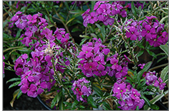
Poem Lilac Wallflower flowers