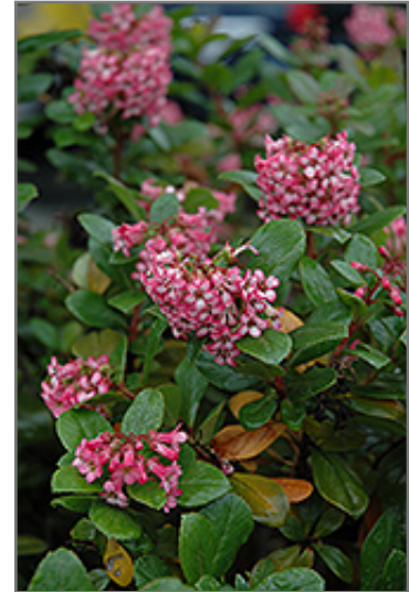
Newport Dwarf Escallonia flowers

Newport Dwarf Escallonia is recommended for the following landscape applications;