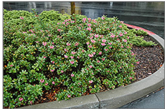
Newport Dwarf Escallonia in bloom