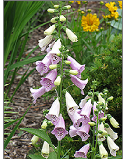
Foxy Foxglove flowers