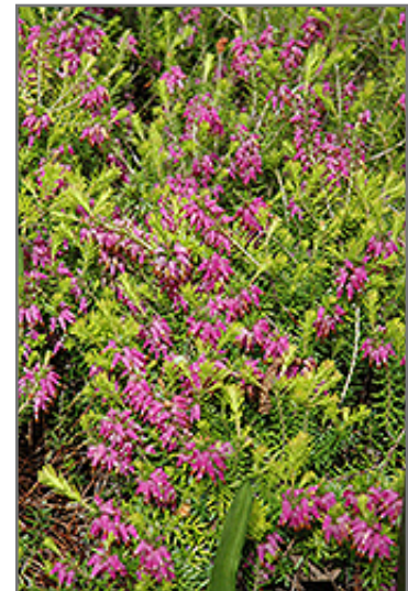
Myretoun Ruby Heath flowers