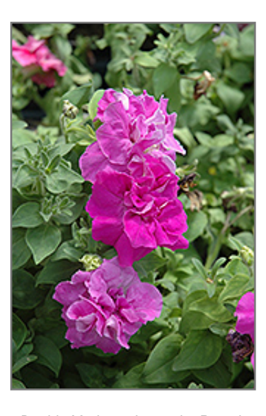
Double Madness Lavender Petunia flowers