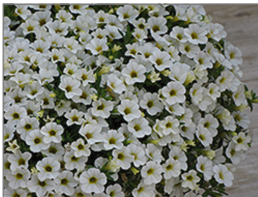
Cabaret White Calibrachoa flowers