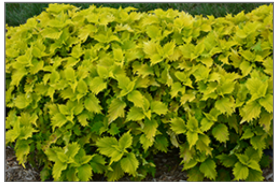
Wasabi Coleus