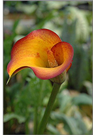
Flame Calla Lily flowers