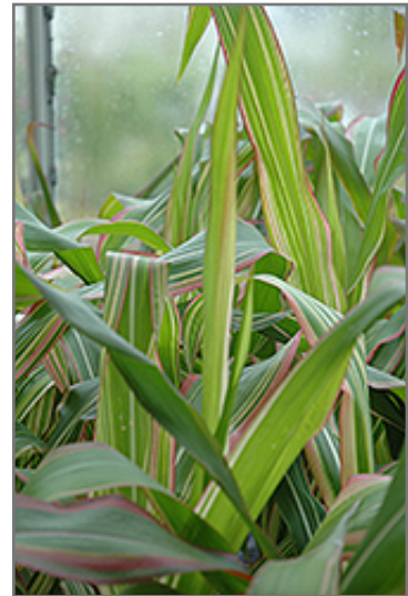
Field Of Dreams Ornamental Corn foliage

This plant does best in full sun to partial shade. It prefers to grow in average to moist conditions, and shouldn't be allowed to dry out. It is not particular as to soil type or pH. It is somewhat tolerant of urban pollution. This is a selection of a native North American species.