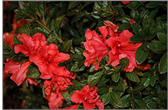
Encore Autumn Princess Azalea flowers

Encore Autumn Princess Azalea will grow to be about 4 feet tall at maturity, with a spread of 3 feet. It tends to be a little leggy, with a typical clearance of 1 foot from the ground. It grows at a slow rate, and under ideal conditions can be expected to live for 40 years or more.