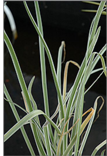
Variegated Society Garlic foliage

This plant is quite ornamental as well as edible, and is as much at home in a landscape or flower garden as it is in a designated herb garden. It does best in full sun to partial shade. It prefers to grow in moist to wet soil, and will even tolerate some standing water. It is not particular as to soil type or pH. It is somewhat tolerant of urban pollution. This is a selected variety of a species not originally from North America. It can be propagated by division; however, as a cultivated variety, be aware that it may be subject to certain restrictions or prohibitions on propagation.