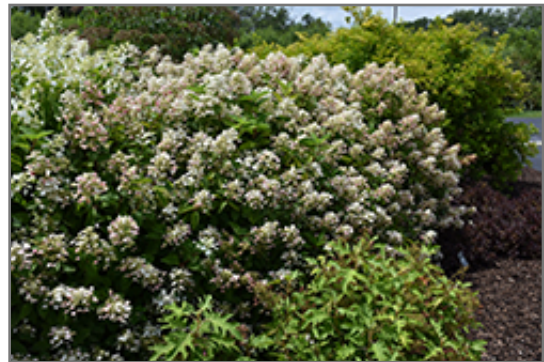
Fire And Ice Hydrangea in bloom