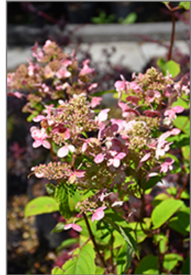
Fire And Ice Hydrangea flowers

Fire And Ice Hydrangea makes a fine choice for the outdoor landscape, but it is also well-suited for use in outdoor pots and containers. With its upright habit of growth, it is best suited for use as a 'thriller' in the 'spiller-thriller-filler' container combination; plant it near the center of the pot, surrounded by smaller plants and those that spill over the edges. It is even sizeable enough that it can be grown alone in a suitable container. Note that when grown in a container, it may not perform exactly as indicated on the tag - this is to be expected. Also note that when growing plants in outdoor containers and baskets, they may require more frequent waterings than they would in the yard or garden.