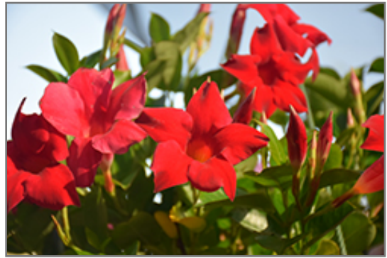
Sun Parasol Crimson Mandevilla flowers

This plant is native to the tropics and prefers growing in moist environments with evenly warm conditions all year round. In our climate, it is usually grown as an outdoor annual in the garden or in a container. If you want it to survive the winter, it can be brought in to the house and provided with special care, and then returned to the garden the following season. In its preferred tropical habitat, as a shrub it can grow to be around 10 feet tall at maturity, with a spread of 24 inches. However, when grown as an annual or when overwintered indoors, it can be expected to perform quite differently, and its exact height and spread will depend on many factors; you may wish to consult with our experts as to how it might perform in your specific application and growing conditions.