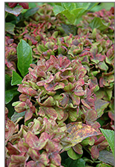
Pistachio Hydrangea flowers