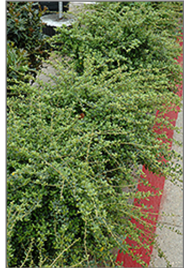
Helleri Japanese Holly

This shrub does best in full sun to partial shade. It prefers to grow in average to moist conditions, and shouldn't be allowed to dry out. It is very fussy about its soil conditions and must have rich, acidic soils to ensure success, and is subject to chlorosis (yellowing) of the foliage in alkaline soils. It is highly tolerant of urban pollution and will even thrive in inner city environments. Consider applying a thick mulch around the root zone in winter to protect it in exposed locations or colder microclimates. This is a selected variety of a species not originally from North America.