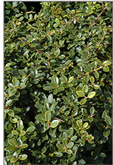
Helleri Japanese Holly foliage