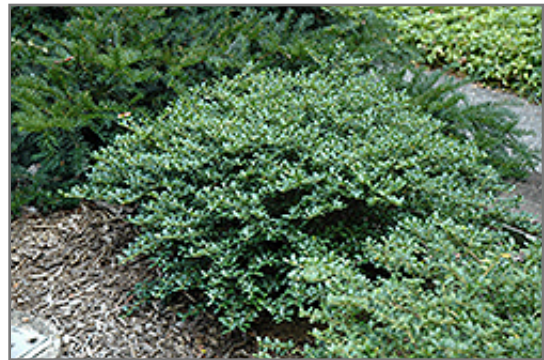
Helleri Japanese Holly