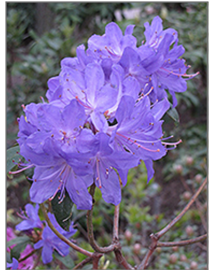
Blue Baron Rhododendron flowers