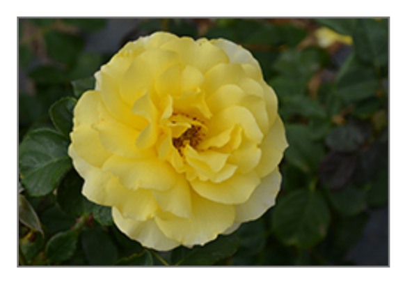
Sparkle And Shine Rose flowers

This shrub will require occasional maintenance and upkeep, and is best pruned in late winter once the threat of extreme cold has passed. It is a good choice for attracting bees to your yard. Gardeners should be aware of the following characteristic(s) that may warrant special consideration;