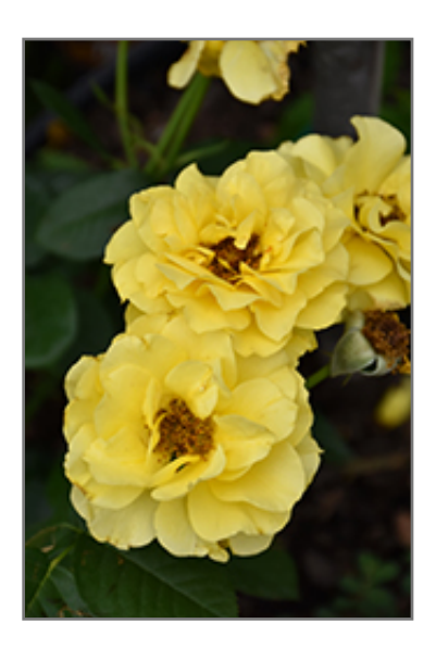
Sparkle And Shine Rose flowers

This shrub should only be grown in full sunlight. It does best in average to evenly moist conditions, but will not tolerate standing water. It is not particular as to soil type or pH. It is highly tolerant of urban pollution and will even thrive in inner city environments. This particular variety is an interspecific hybrid.