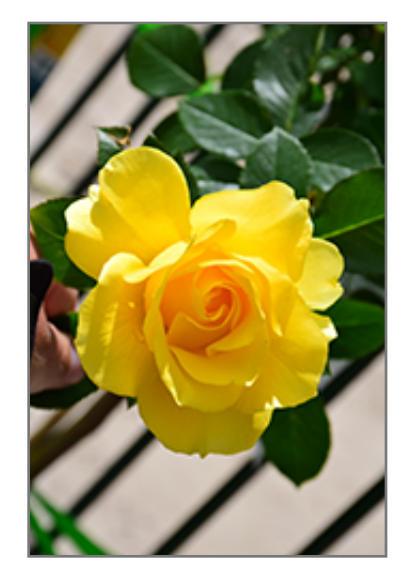
Sparkle And Shine Rose flowers