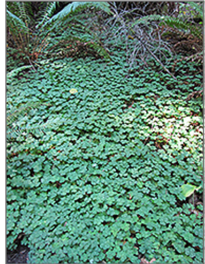
Redwood Sorrel