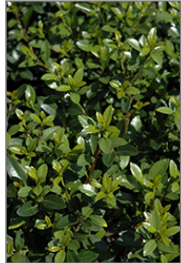
Green Island Japanese Holly foliage

Green Island Japanese Holly will grow to be about 4 feet tall at maturity, with a spread of 7 feet. It has a low canopy. It grows at a medium rate, and under ideal conditions can be expected to live for 50 years or more.