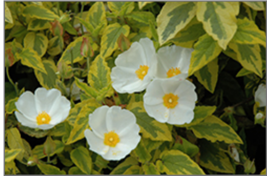
Mickie Rockrose flowers

Mickie Rockrose is recommended for the following landscape applications;