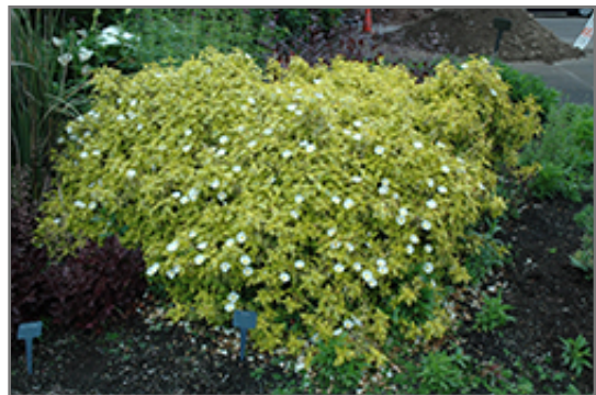
Mickie Rockrose in bloom