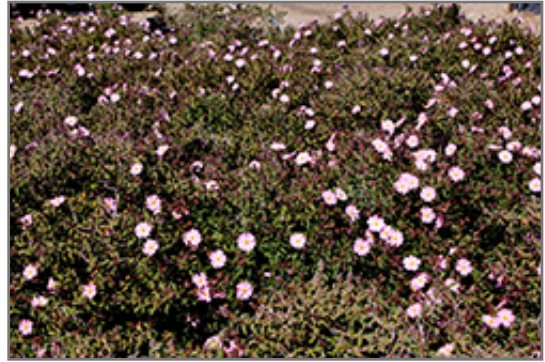
Pink Rockrose in bloom