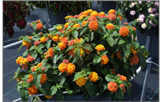
Lucky Flame Lantana in bloom

Lucky Flame Lantana will grow to be about 16 inches tall at maturity, with a spread of 14 inches. When grown in masses or used as a bedding plant, individual plants should be spaced approximately 12 inches apart. It has a low canopy. It grows at a fast rate, and under ideal conditions can be expected to live for approximately 20 years.