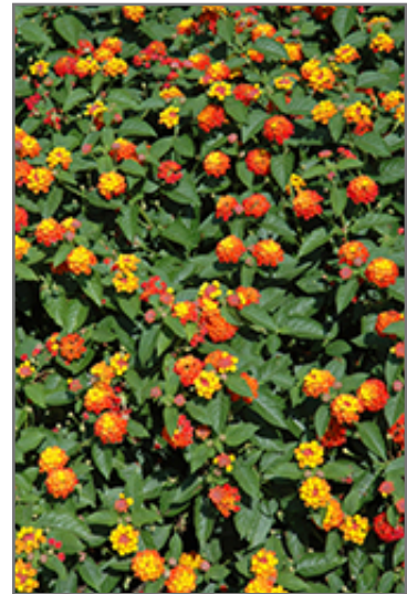
Lucky Flame Lantana flowers

Lucky Flame Lantana is recommended for the following landscape applications;