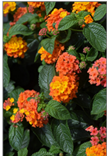
Lucky Flame Lantana flowers