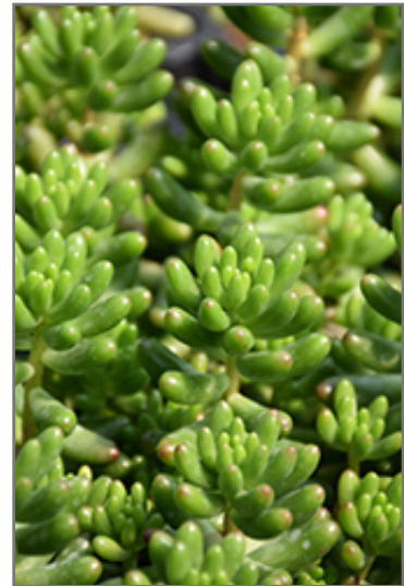
Jelly Bean Plant foliage

When grown indoors, Jelly Bean Plant can be expected to grow to be only 5 inches tall at maturity, with a spread of 14 inches. It grows at a medium rate, and under ideal conditions can be expected to live for approximately 10 years. This houseplant will do well in a location that gets either direct or indirect sunlight, although it will usually require a more brightly-lit environment than what artificial indoor lighting alone can provide. It prefers dry to average moisture levels with very well-drained soil, and may die if left in standing water for any length of time. This plant should be watered when the surface of the soil gets dry, and will need watering approximately once each week. Be aware that your particular watering schedule may vary depending on its location in the room, the pot size, plant size and other conditions; if in doubt, ask one of our experts in the store for advice. Like most succulents and cacti, it prefers to grow in poor soils and should therefore never be fertilized. It is not particular as to soil pH, but grows best in poor soil. Contact the store for specific recommendations on pre-mixed potting soil for this plant. Be warned that parts of this plant are known to be toxic to humans and animals, so special care should be exercised if growing it around children and pets.