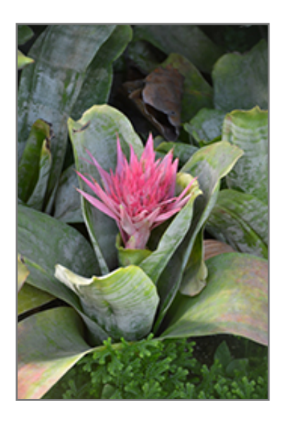
Urn Plant in bloom