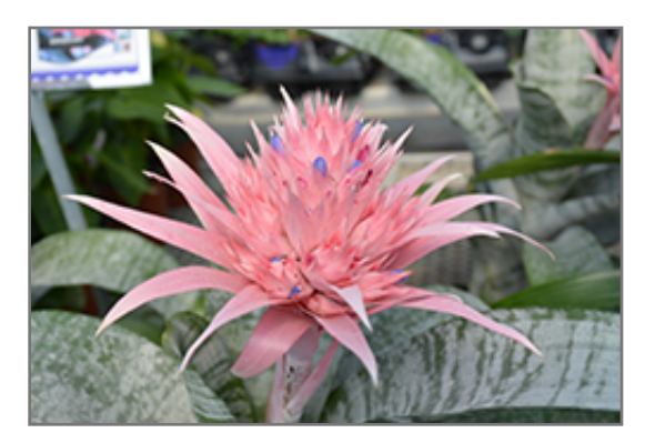
Urn Plant flowers

This is an herbaceous evergreen houseplant with a shapely form and gracefully arching foliage. Its relatively coarse texture stands it apart from other indoor plants with finer foliage. This plant should never be pruned unless absolutely necessary, as it tends not to take pruning well.