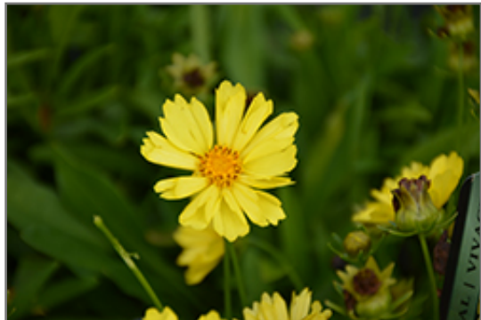
Leading Lady Sophia Tickseed flowers

Leading Lady Sophia Tickseed is recommended for the following landscape applications;