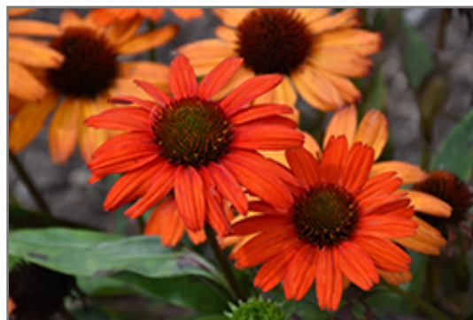
Kismet Intense Orange Coneflower flowers