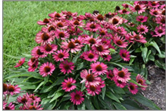
Kismet Raspberry Coneflower in bloom

Kismet Raspberry Coneflower will grow to be about 16 inches tall at maturity, with a spread of 24 inches. Its foliage tends to remain dense right to the ground, not requiring facer plants in front. It grows at a fast rate, and under ideal conditions can be expected to live for approximately 10 years. As an herbaceous perennial, this plant will usually die back to the crown each winter, and will regrow from the base each spring. Be careful not to disturb the crown in late winter when it may not be readily seen!