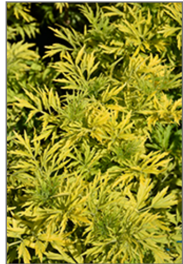
Golden Tower Elder foliage