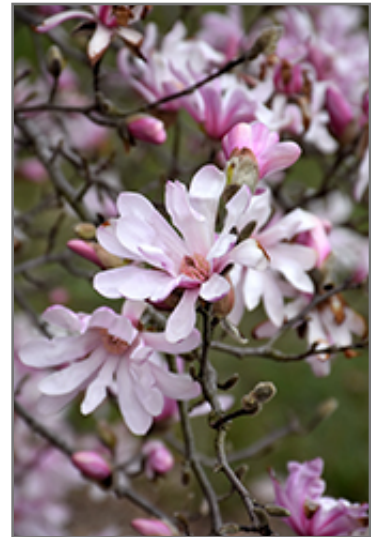
Leonard Messel Magnolia flowers