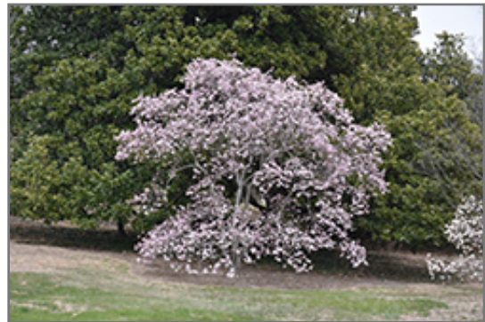
Leonard Messel Magnolia in bloom