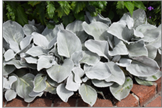
Angel Wings Senecio

Angel Wings Senecio is recommended for the following landscape applications;