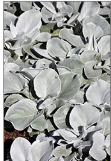
Angel Wings Senecio foliage