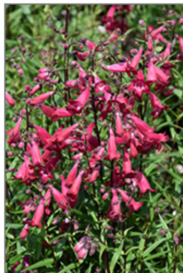
MissionBells Deep Rose Beard Tongue flowers

MissionBells Deep Rose Beard Tongue is recommended for the following landscape applications;