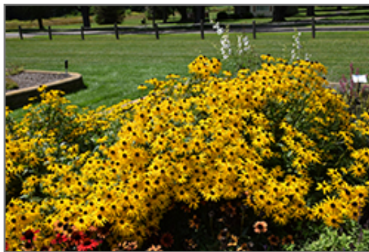
Glitters Like Gold Coneflower in bloom