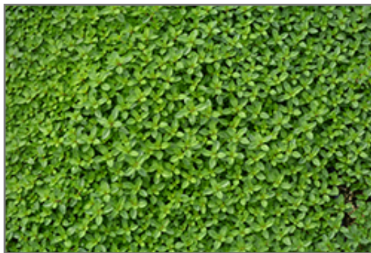
Creeping Thyme foliage