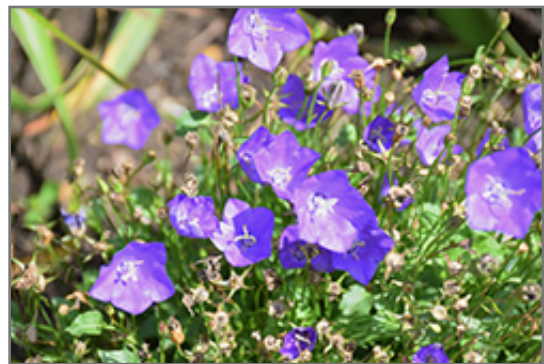
Violet Teacups Bellflower flowers