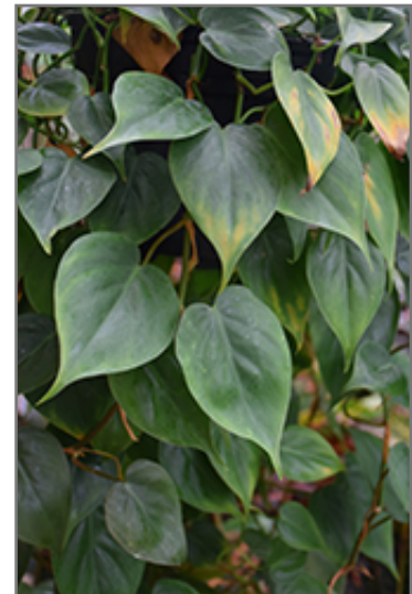
Jade Pothos foliage