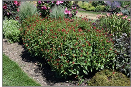
Little Redhead Indian Pink in bloom

Little Redhead Indian Pink will grow to be about 20 inches tall at maturity, with a spread of 24 inches. When grown in masses or used as a bedding plant, individual plants should be spaced approximately 20 inches apart. Its foliage tends to remain dense right to the ground, not requiring facer plants in front. It grows at a fast rate, and under ideal conditions can be expected to live for approximately 5 years. As an herbaceous perennial, this plant will usually die back to the crown each winter, and will regrow from the base each spring. Be careful not to disturb the crown in late winter when it may not be readily seen!