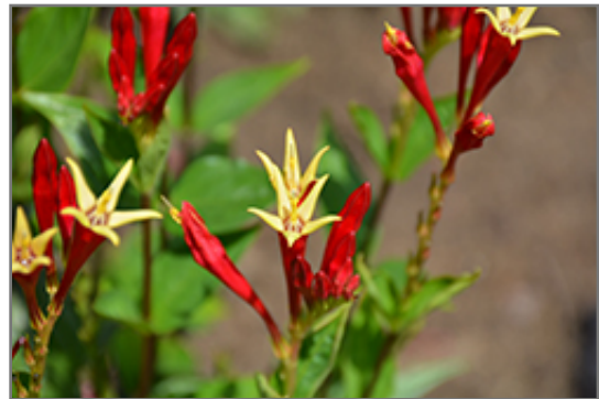
Little Redhead Indian Pink flowers