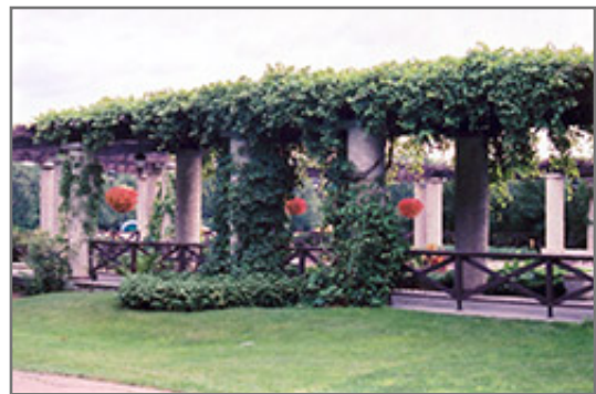
Virginia Creeper